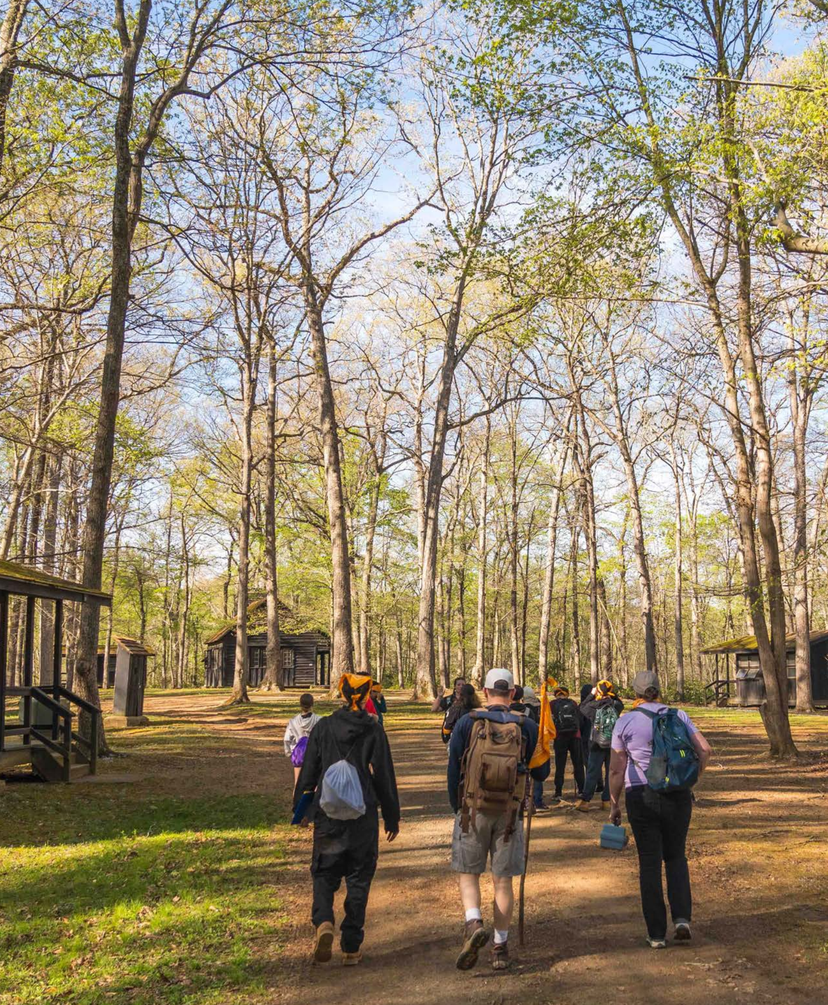
NatureBridge Prince William Forest Park Founded 2012